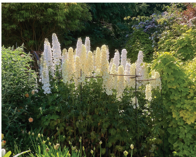
New gardens opened; 2022: Top: Tatyana Aplin welcomed visitors to her Berwickshire garden with star baking Bottom: Glorious Delphiniums at Nigel Stanton's Garden in Conon Bridge

"The team supports our 23 Districts and some 200 regular volunteers."