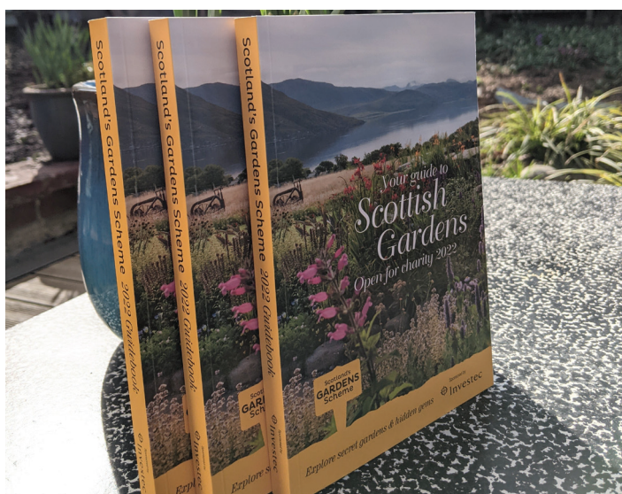
Our 2022 Guidebook

A range of signature yellow branded posters for garden open days across the country