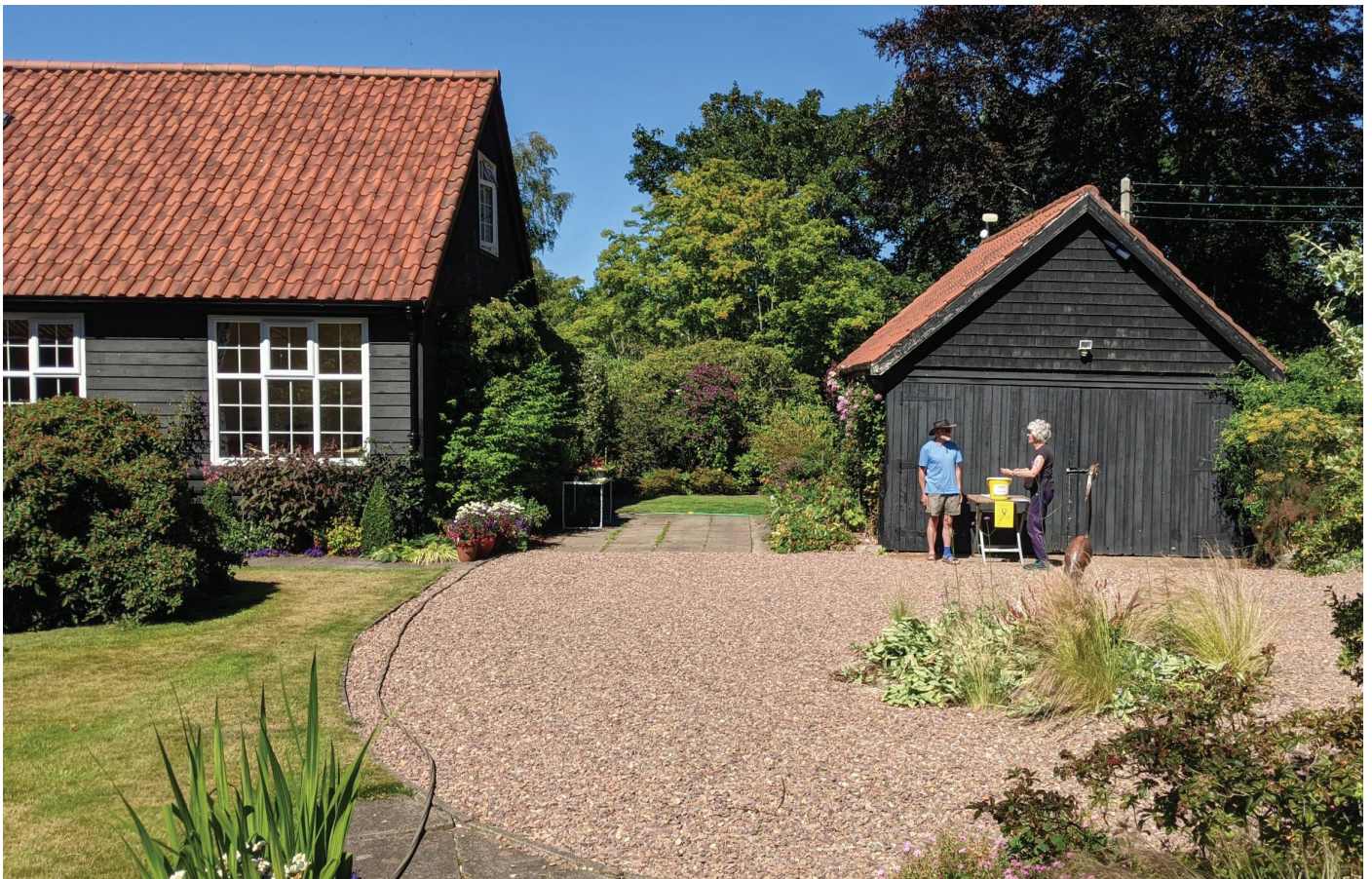
Welcoming guests to Humble Dean