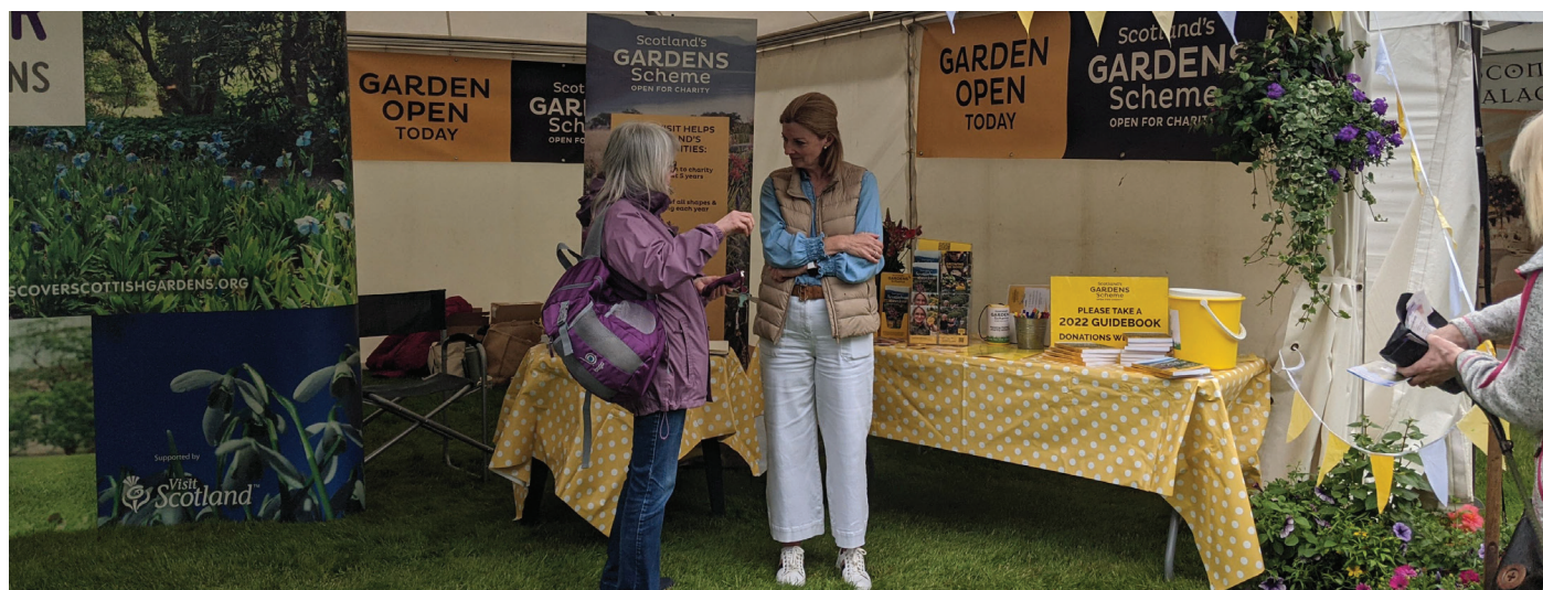
The Perthshire Team supported our stand at Scone Palace Garden Fair

And many, many more donations to charities around the country.