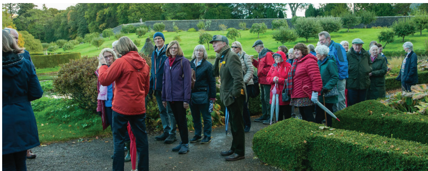
Garden tour of Hercules Garden at Blair Castle at our September Conference