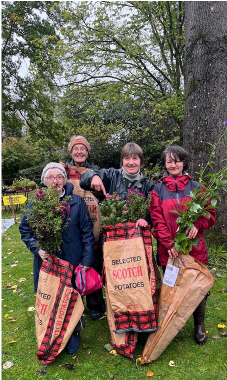
Fife volunteers at St Andrew's Autumn Plant Sale

We created and distributed our annual guidebook of open gardens, which remains popular with our key audiences and has a print run of 8,500