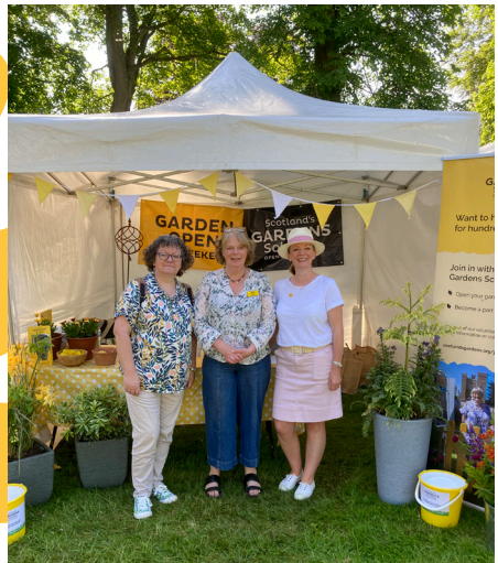
SGS team at Scone Palace Garden Fair 2023