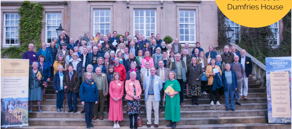
Our 2023 Conference

We welcomed around 120 garden owners & volunteers to our September conference at Dumfries House